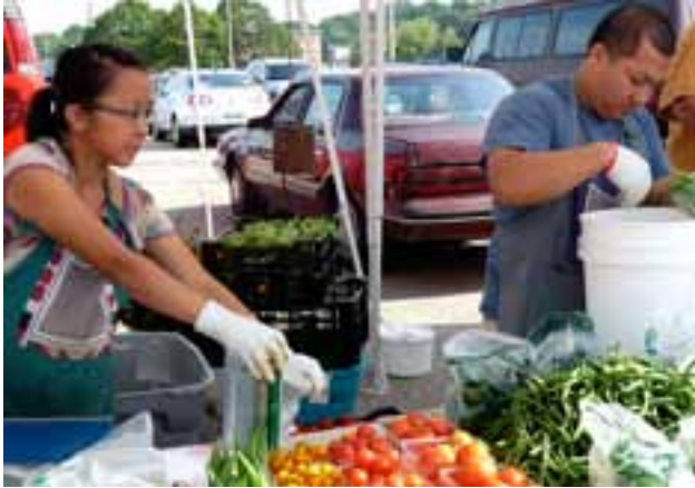
Farmers' markets around the state help localize the economy.

policies may not favor localization. Examples included development of infrastructure to support outlying big box retailers, a jobs-only approach to development without considering green jobs and not prioritizing local and small over big and new businesses.